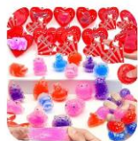
$2.00 Mochi Squeeze Toy

Student Council members will come to each classroom to take orders and collect cash.