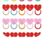
$1.00 Knot Bracelet