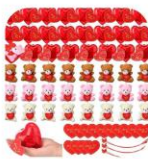
$3.00 Valentine Bear Stuffed Keychain