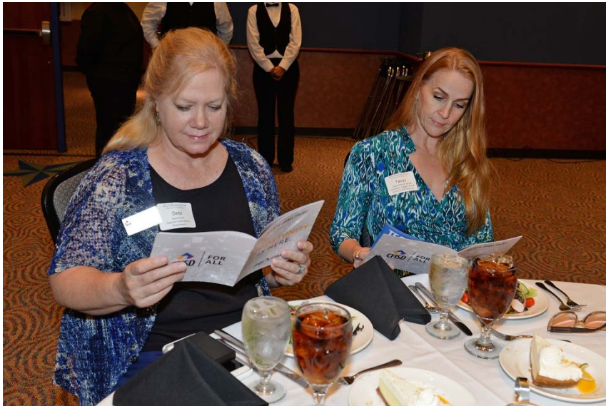
Cy-Fair Houston Chamber of Commerce luncheon guests view the annual State of the District brochure on Sept. 20.

We are a large and growing community that continues to hold fast to the traditional American value of universal public education. 96.91 percent of school-aged children in our community choose public schools. If you look through the resources on our State of the District webpage , I think you'll see why.